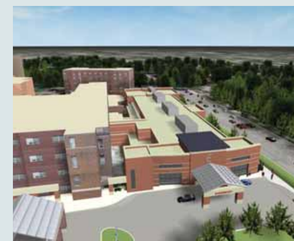
Walk-in Entrance, Aerial View